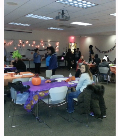
NHCC students enjoying the PLSA Halloween festivities, which included Halloween movie trivia and treats.

ship, I will distribute the packet and syllabus, and I'll answer any questions. Please plan on attending if you registered for the Spring 2014 course. If you can't make the orientation session, please email me after the session and I will email you the packet. It will not be available before November 22. If you have any questions, please feel free to contact me at mfenske@nhcc.edu or 763-488-0294.