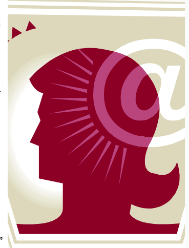
Women in eDiscovery is free to join! Why wait?