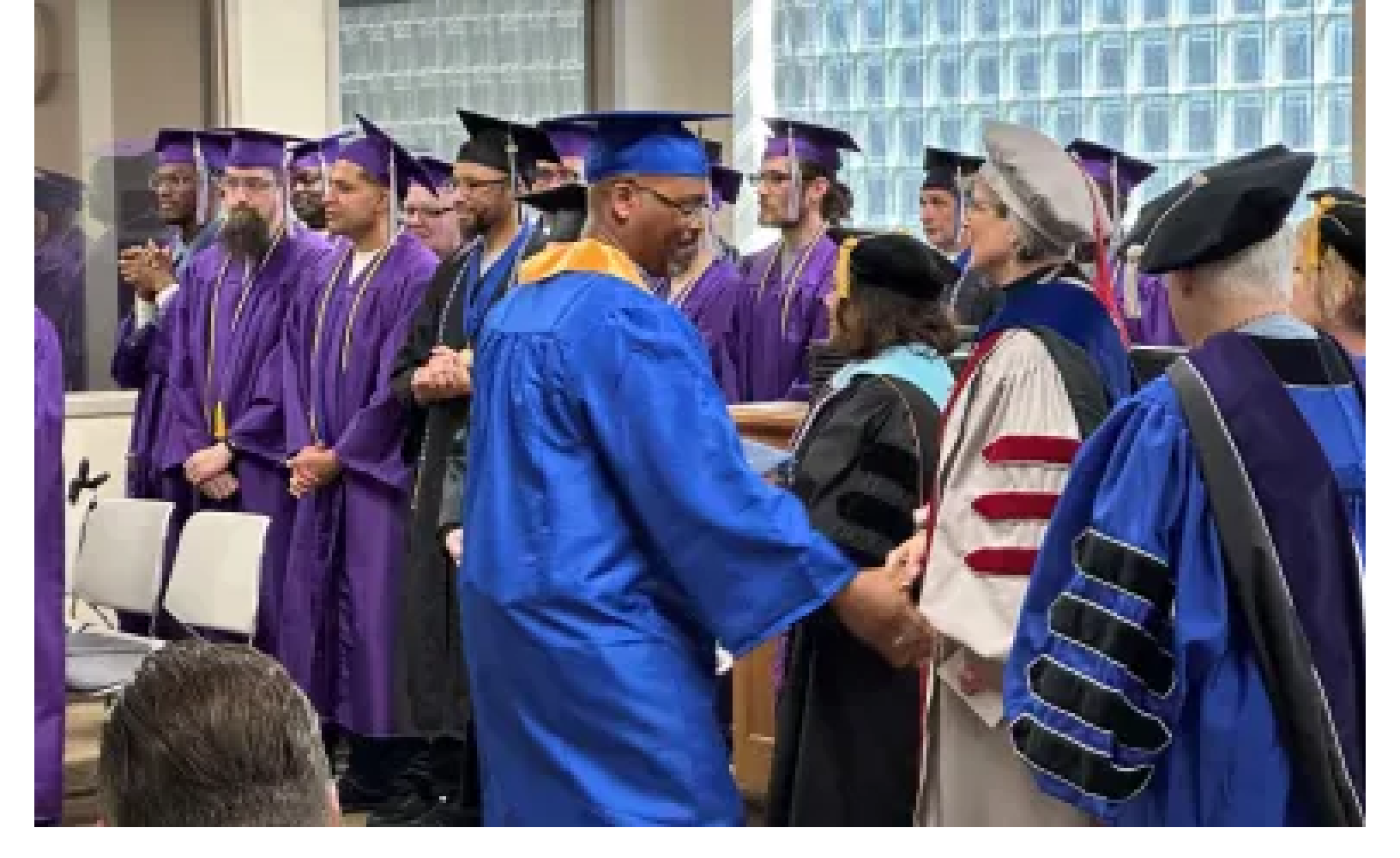
Paralegal Program Receives 2023 Award >