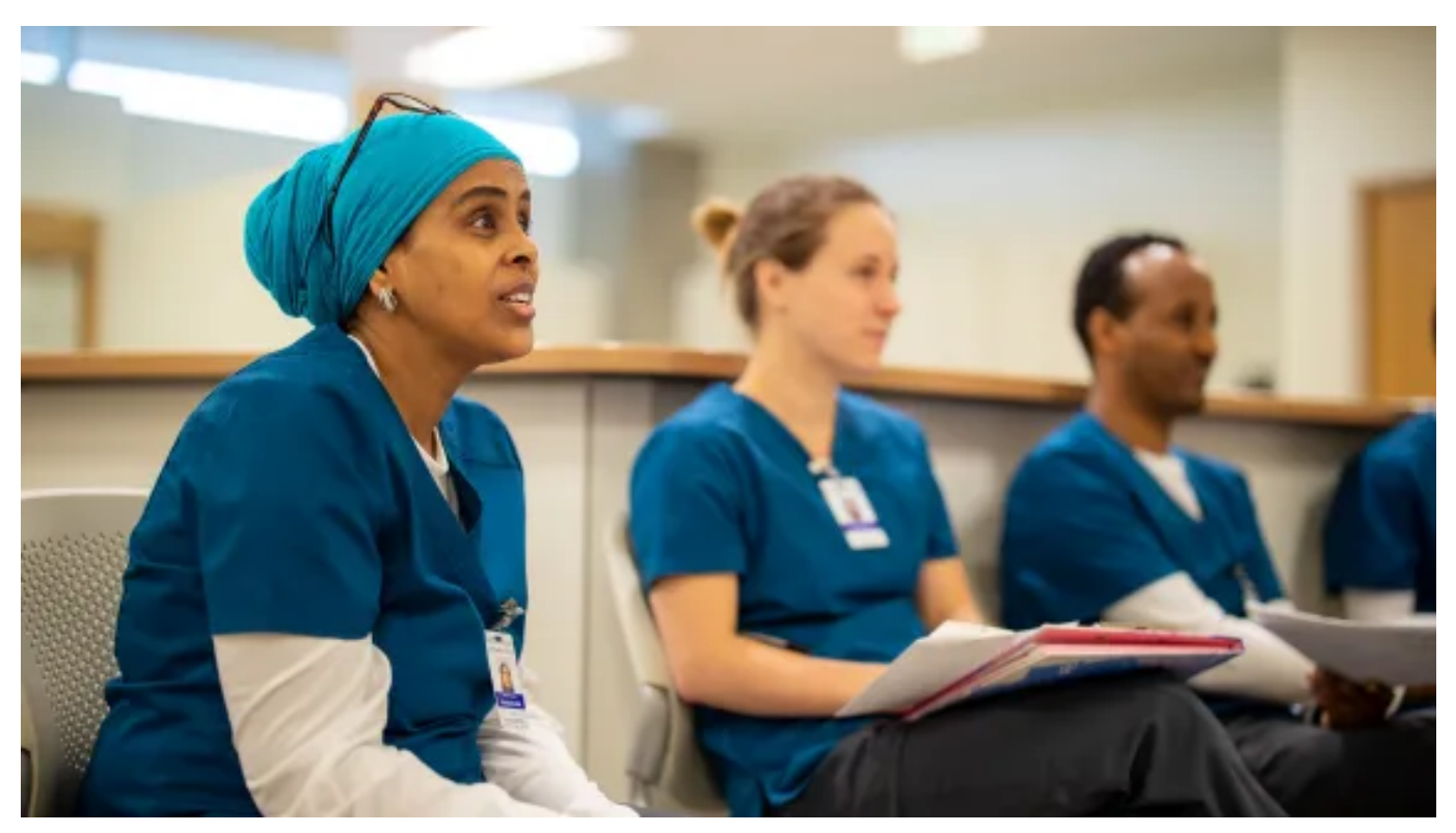
Nursing Program Admissions >

The nursing application is currently closed. The next application cycle will open December 1, 2023-February 1, 2024 for a Fall program admission.