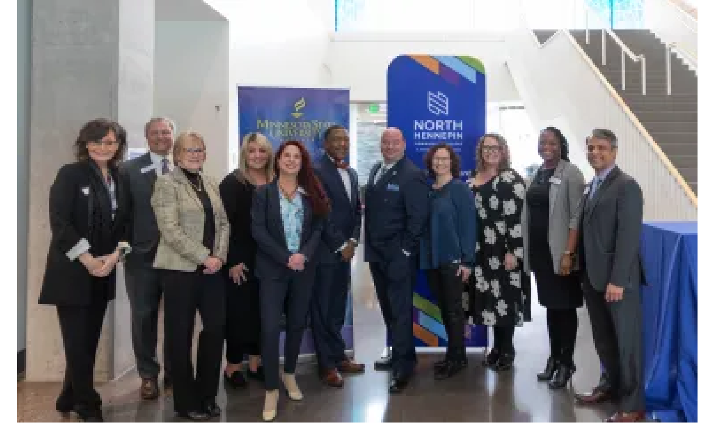
New MSU Mankato & NHCC Partnership Offers Online Nursing BS Degree >