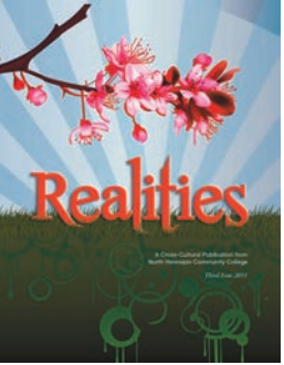
Third Issue 2011