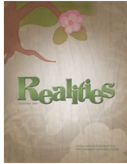
Second Issue 2010