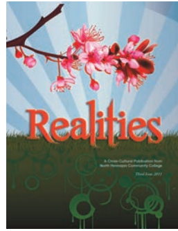
Third Issue 2011