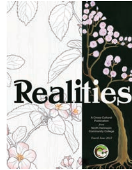
Fourth Issue 2012